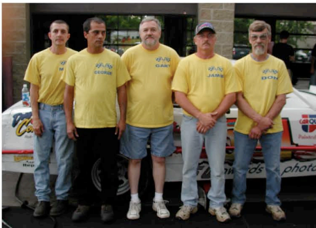
Got their first taste last year. Will they come back for more? Challengers Briggs Auto

Keep up to date with the latest Pit Crew Team entries by checking out the Website through August. Winners will be announced there as well. There's still time to enter. The Pit Crew is a great team builder. Think of the bragging rights if your pencil-pushers beat J&T's Pro Auto Wrestlers!